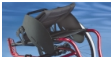
Fold-down back with non-removable side guards available.