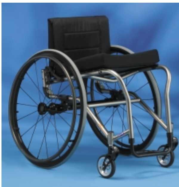
The Bead Blast A4 Titanium rigid wheelchair shown has tapered front end and the Lightweight Shock Stopper™ (LSS) suspension option. Invacare's LSS suspension package makes the A4 and A4 Titanium with full suspension option the lightest-in-class.