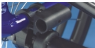
The anti-tipper clamp attaches to the inside of the camber tube clamp, maintaining a constant relationship with the wheel axle.