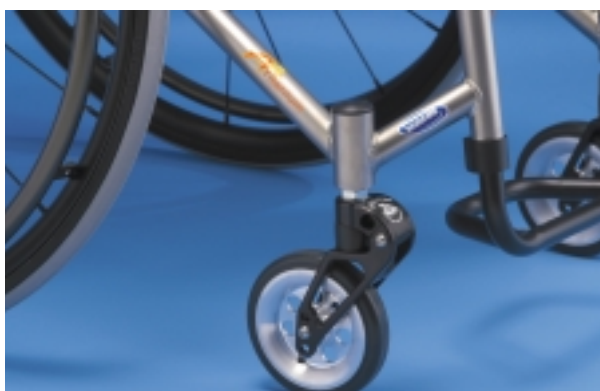
Frog Legs® front suspension forks absorb initial impact slowing vibration before it gets to the user.

Greater Comfort and Endurance Reduces muscle contraction on rougher terrain allowing for a more comfortable ride and greater endurance.