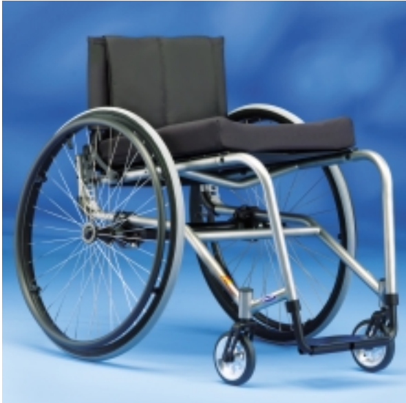
The Bead Blasted A4 Titanium rigid wheelchair shown has a “V” front end and 24” spoked wheels with Primo™ tires, aluminum anodized handrims, one-piece adjustable angle footboard and 5” aluminum urethane casters.

B est of Both Worlds – Same Great Design in Aluminum and Titanium. Understanding the advantages of the Invacare® A4™ and A4 Titanium rigid wheelchairs is simple. The A4 is the toughest, most easily adjustable, lightweight, aluminum frame rigid chair. The A4 Titanium offers the same great features in a lighter titanium frame.