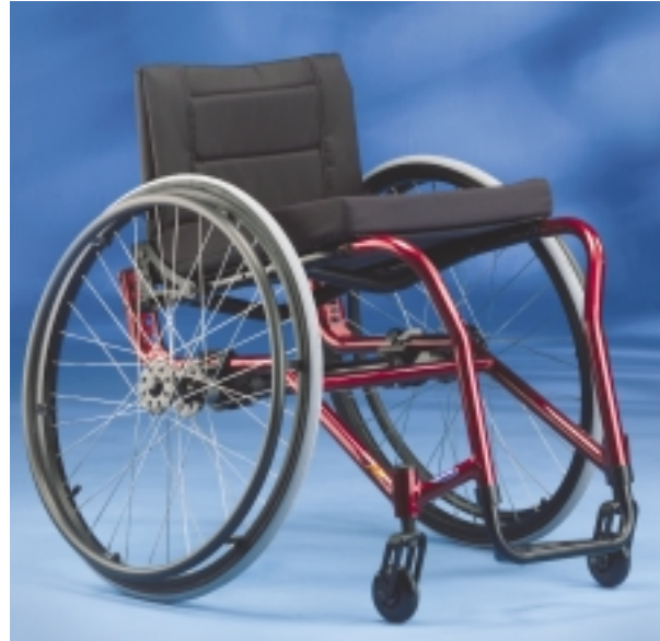
The Electric Red A4 rigid wheelchair shown has a tapered front end, 24” high performance spoked wheels with Primo™ tires, aluminum anodized handrims, one-piece adjustable angle footboard and 3” rollerblade casters.