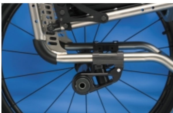
LSS dual rear shocks absorb energy independently for added stability.

The Invacare Lightweight Shock Stopper™ (LSS) suspension option is like no other suspension package available. It's a lightweight, tuned system that balances shock absorption with performance. Finally, consumers can get a comfortable ride AND the performance they demand from a rigid chair.