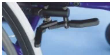
Hideaway Undermount Wheel Locks provide smooth locking action and remain out of the way while propelling and transferring.