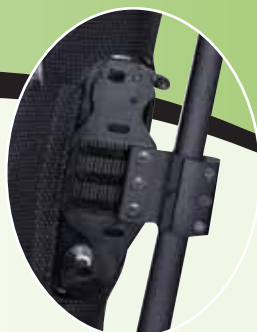
'Easy Set' hardware used for both the MaTRx-PB Elite and Posture Back