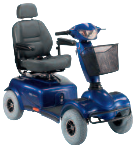
Model no. S8465-ARIN - Red Model no. S8465-SBIN - Blue

The Invacare® Meteor is a comfortable, safe ride providing complete freedom to enjoy total independence. This robust scooter incorporates a powerful motor designed to carry a maximum user weight of 440 lbs. A convenient driving position can be obtained by adjusting seat height and horizontal seat position. The armrests are width and height adjustable, with a reclining backrest that can be angled to your requirements. Finally, the swivel seat and swing-up armrests allow for easy transfer when getting on and off of the Meteor. The Meteor is available in a 4-wheel version only and emphasizes safety, user friendliness and unique driving capabilities.