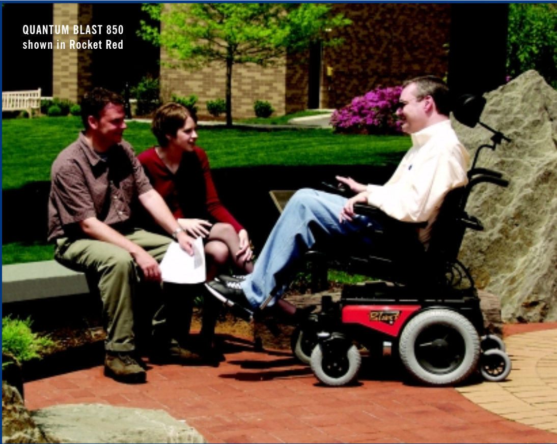
QUANTUM BLAST 850 shown in Rocket Red