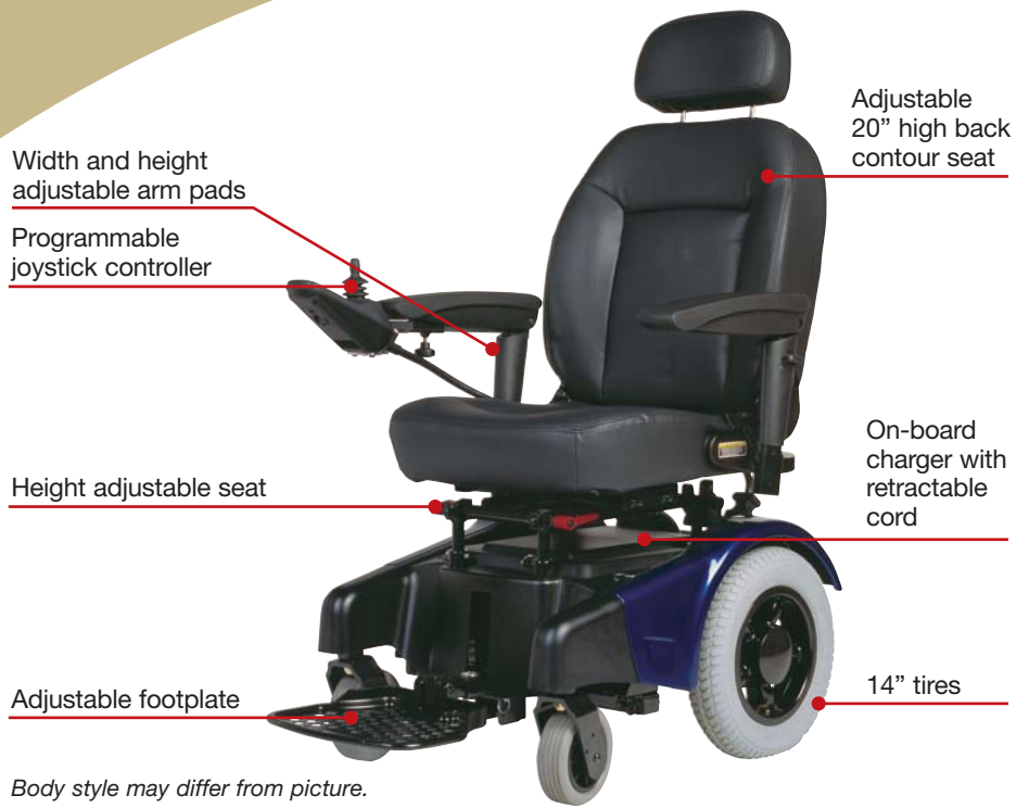
Body style may differ from picture.