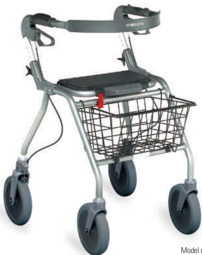
Model no. 12160