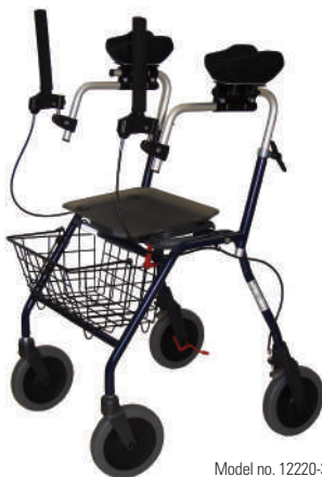
Model no. 12220-35-01