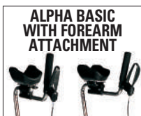
Model no. 12230-35-01