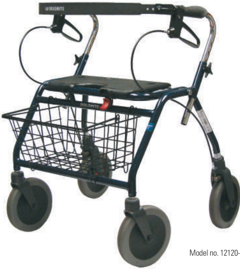
Model no. 12120-37-746