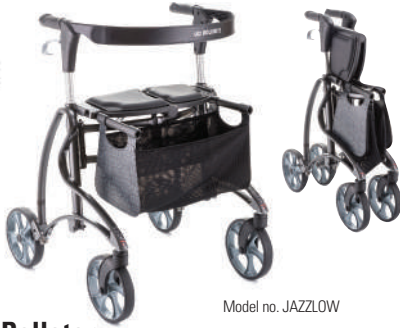
Model no. JAZZLOW