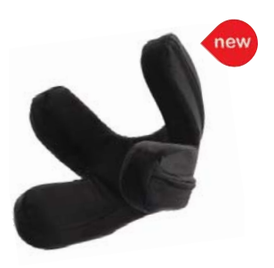
9" x 7" 4 Point Pad